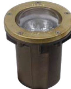
SL-20-SMLNL120V-BRS with PAR20 lamp installed