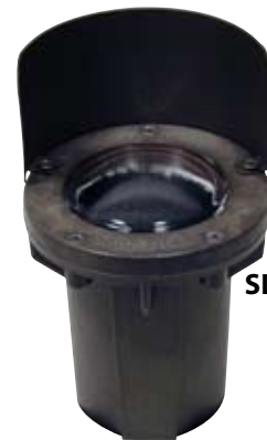
SL-20-SMLLEDP2040 with FA-135SM-BRT